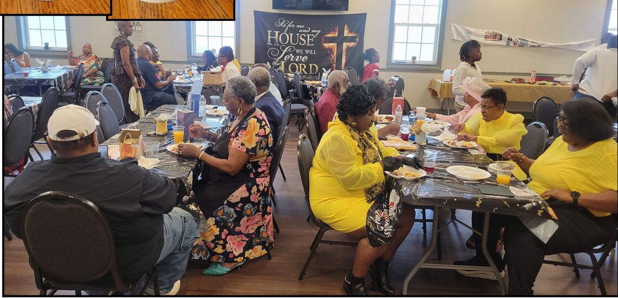
Fellowship Meal: (below) The women also prepared a Brunch for the Fathers. In all, it was a wonderful time of food, fellowship, and fun.