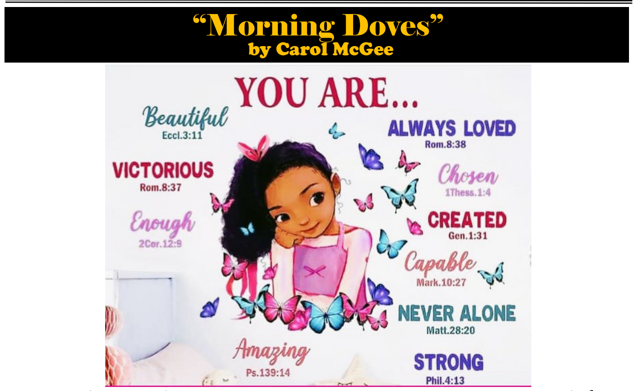
"Don't let anyone look down on you because you are young, but set an example for the believers in speech, in conduct, in love, in faith, and purity." —1 TIMOTHY 4:12 NIV

I have decided to start doing what GOD has called me to do. For years I have been running and battling with this because I was more worried about what people would say, or think of me. But coming to this I asked GOD, if this is what You want me to do, then give me the name of the group, the vision,